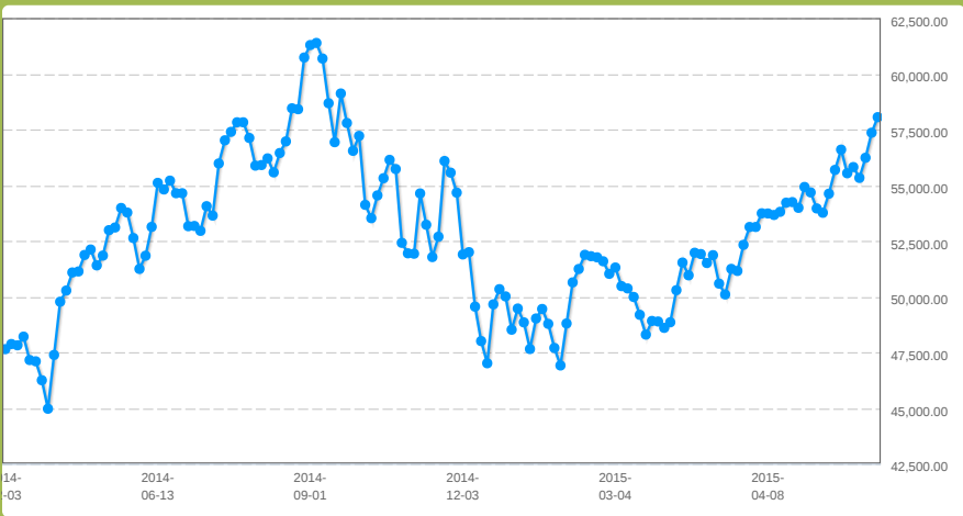
Brazil IBOV:IND Equity Index

Turkey Stance Turkey Valuations Turkey Top Stock Picks Turkey Top Bond Picks Turkey Last Month Performance Review