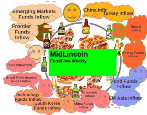
Chart: Emerging Markets Funds - Outflows Less

Emerging Markets Total Fund FLOws still in negative zone, but equities show small inflow.