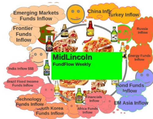
Chart: Fund Flow First Week of June Biggest Winners/Losers